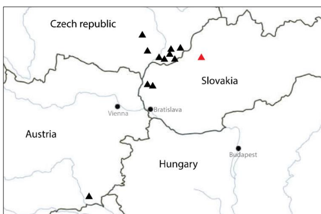
Fig. 1 The position of new record of Taraxacum paludem-ornans in the Western Carpathians. Black triangle – previously published records by Kirschner & Štěpánek (1998); red triangle – new record; black circle – capitals.

New record for the flora of the Western Carpathians Mts. and the third in Slovakia. This finding represents the easternmost limit for the distribution area of this microspecies (Fig. 1). Very rare species from the section Palustria known also from SE Moravia and with a single locality in Austria (Kirschner & Štěpánek 1998).