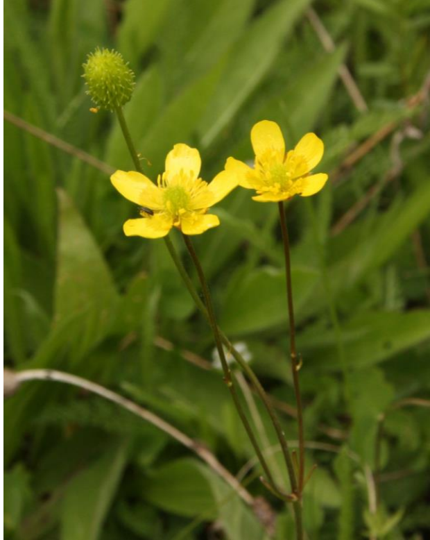
Fig. 1 Ranunculus pedatus Waldst. et Kit. flowers and characteristic cylindrical aggregate fruits (apocarpium).