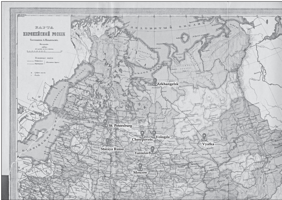
Figure 1: Map of the northern region of European Russia 6

The year of 1870 was the turning point in urban pollution and urban sanitation in the Russian Empire. After the reform of city self-government of 1870, the urban environment and its sanitary conditions became the object of the policy of local authorities, upon which fell the responsibility to address the economic issues of local importance. Moreover, Russia was a country with delayed modernization, where industrial development and population growth started in the last third of the nineteenth century. The Vologda and Novgorod regions had had an agrarian specialization; therefore, bacteriological pollution was the main environmental problem in the cities of both regions. This type of pollution has been an object of some historical research since the 1980s. Works by A. Corbin, D. S. Barnes and R. Evans allow us to follow the evolution of the perception of everyday odours in French society (A. Corbin), the role of the miasmatic and the bacteriological theories in the environmental measures of a government (D. S. Barnes) and the dramatic consequences of bacteriological pollution due to a misguided policy of sanitary protection (R. Evans). 7